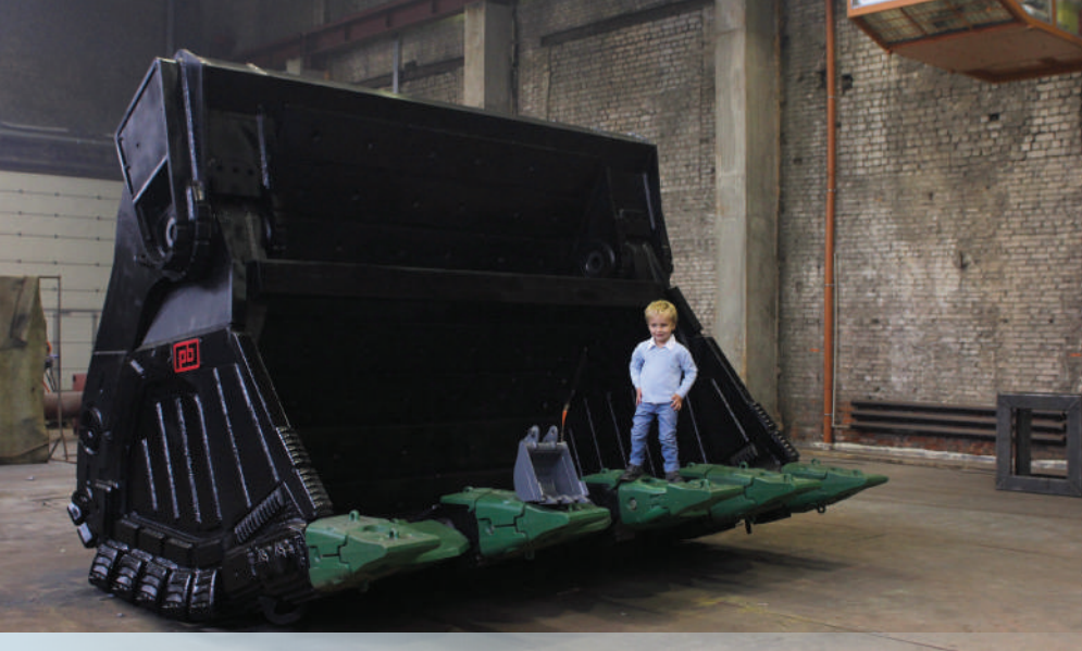
Front shovel bucket for Hitachi EX-3600