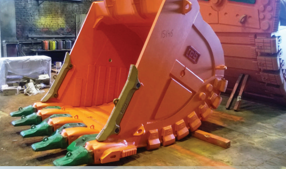
Backhoe bucket for Hitachi EX-1200