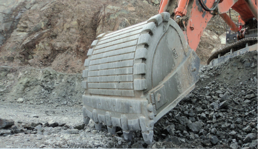
Backhoe bucket for Hitachi EX-2600