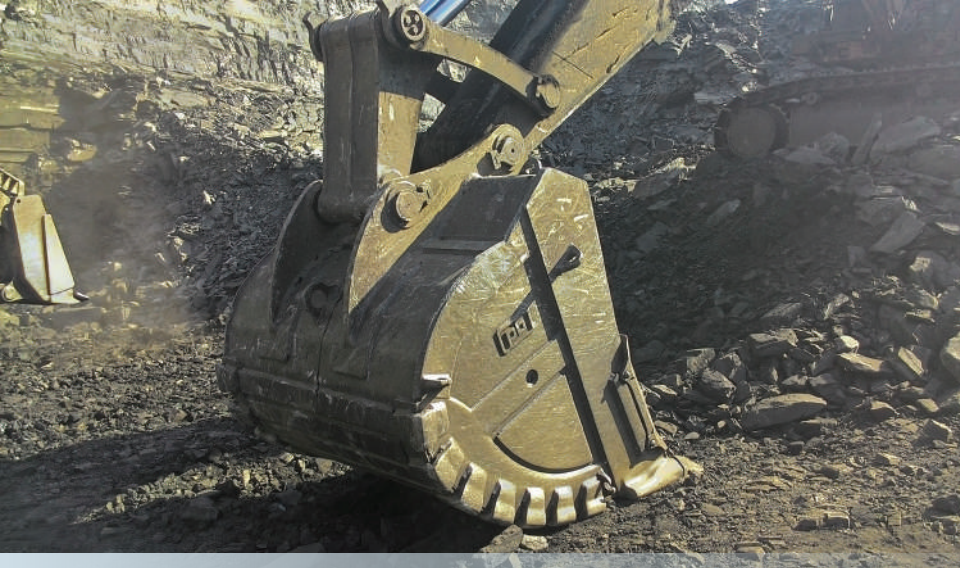
Backhoe bucket for Komatsu PC-1250