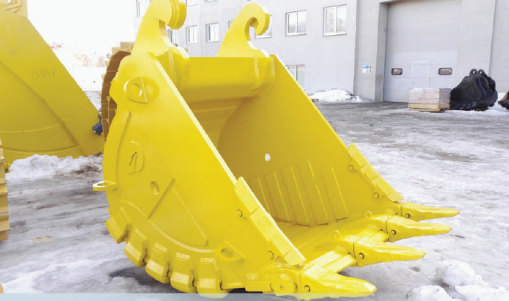
Backhoe bucket for Caterpillar 345-C