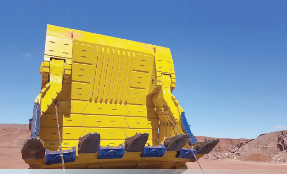
Front shovel bucket for Komatsu PC-4000