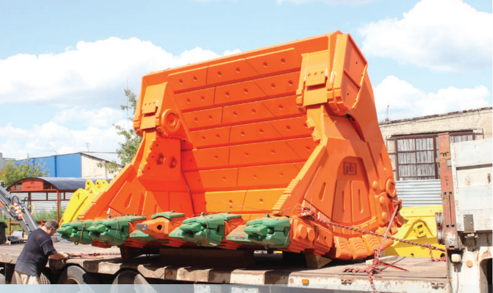
Front shovel bucket for Hitachi EX-3600